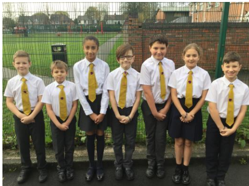
Anti-bullying ambassadors 2021/22

Bullying in any form, and for any reason, will not be tolerated